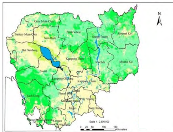
Figure 1: Cambodia forest cover map 2010

wide range of goods and ecosystem services that are especially critical for the rural population. About 85% of the total population live in rural areas (Broadhead and Izquierdo, 2010), and more than 40% of rural households obtain between 20 to 50% of their livelihoods from forest resources (UN-REDD Programme, 2011).